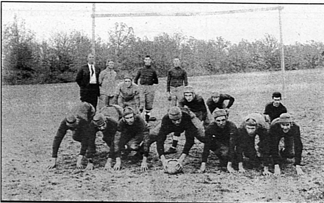
Crocker High School football team, probably in the autumn of 1915.