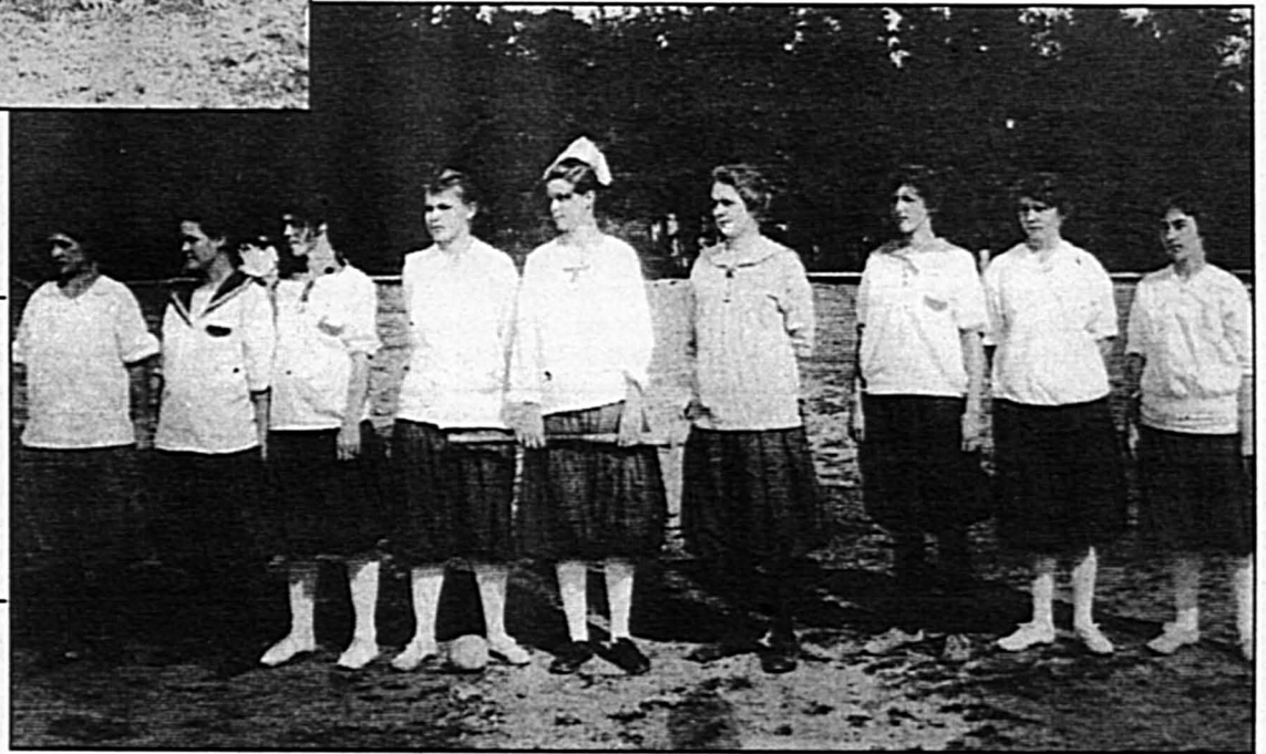
Crocker High School girl's softball team around 1915. Notice the larger than present day, more irregularly shaped ball on the ground between the feet of the fourth girl from the left.