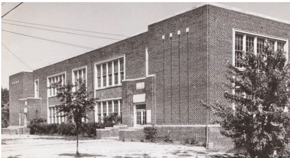
Waynesville High School in the 1950s