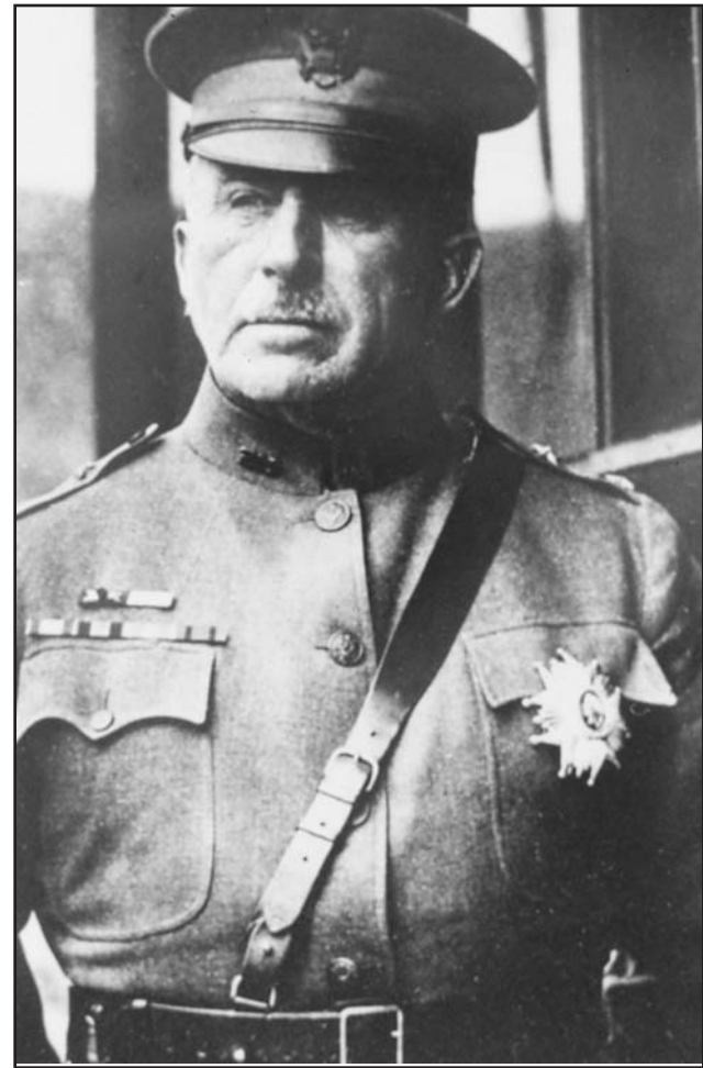
General Leonard Wood toward the end of his career.