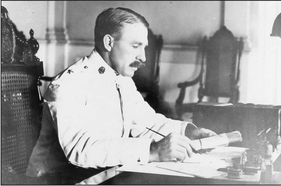
Leonard Wood as Governor of Cuba.

streamlined the old bureaucratic system that slowed up the continued modernization of the Army. He was a key player in developing the Maneuver Division and Mobile Army concept. He stressed preparedness and training. He initiated the Reserve Officer Training Crops. With his term as Chief of Staff over, he trained the 89 th and 10 th Infantry Divisions for European service in World War I.