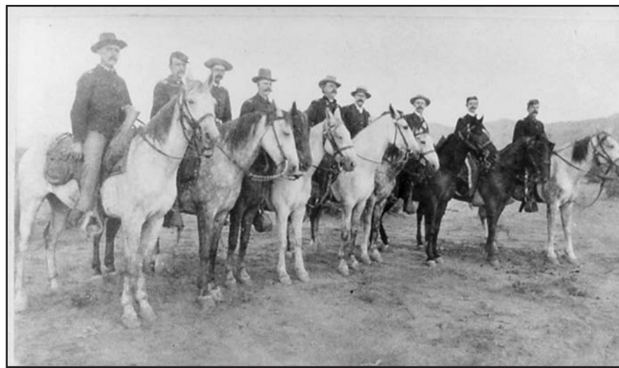
The staff of General Nelson A. Miles. Captain Leonard Wood is far right.

“Naval officers came and went, and Senators were only in the city while the Senate was in session; but there was one friend who was steadily in Washington. This was an army surgeon, Dr. Leonard Wood. I only met him after I entered the navy department, but we soon found that we had kindred tastes and kindred principles. He had served in General Miles's inconceivably harassing campaigns against the Apaches, where he had displayed such courage that he won that most coveted of distinctions—the Medal of Honor; such extraordinary physical strength and endurance that he grew to be recognized as one of the two or three white men who could stand fatigue and hardship as well as an Apache; and such judgment that toward the