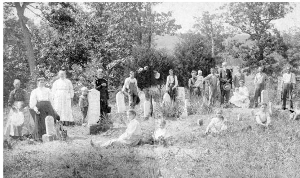
Mayfield Cemetery on the Big Piney River. The gathering appears to be a decoration day.

Then came larger community burial grounds, and gradually plots were