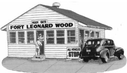
Fort Leonard Wood Main Gate, 1952