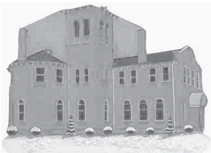
Pulaski County Courthouse