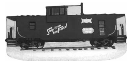
Frisco Caboose Crocker