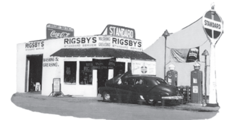
Rigsby's Service Station, ca. 1951