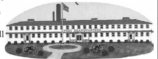
Fort Leonard Wood HQ, ca. 1944