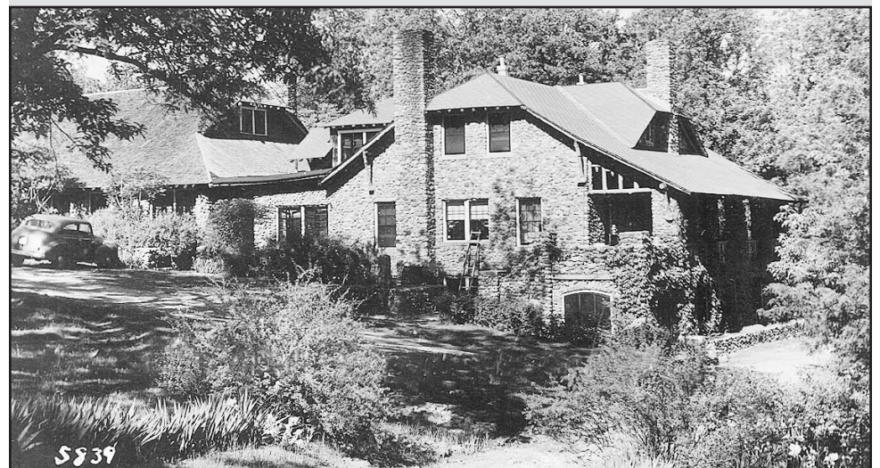
Pippin Place, four miles from Waynesville on the Gasconade River.