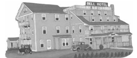
Bell Hotel, ca. 1930

OSS Ornaments 10925 Western Road Duke, MO 65461