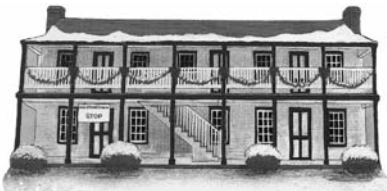
Old Stagecoach Stop

A heavy wire was placed under his lower jaw and around the mouth to which was attached the rope to the hoist and onto the single-tree or drawbar of the tractor. The hog was lifted and dumped butt first into the barrel to which the water, just at the boiling point but not boiling, had been added. We tried not to let the butt hit the bot-