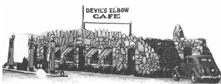
Devil's Elbow Cafe, ca. 1930