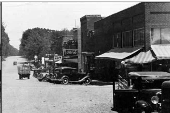
Showing more windows and awnings to shade some of them in a bustling Richland, 1937.