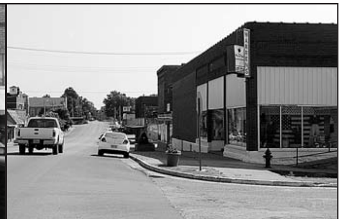
The awnings are gone, as well as some of the windows, but business goes on in 2011.