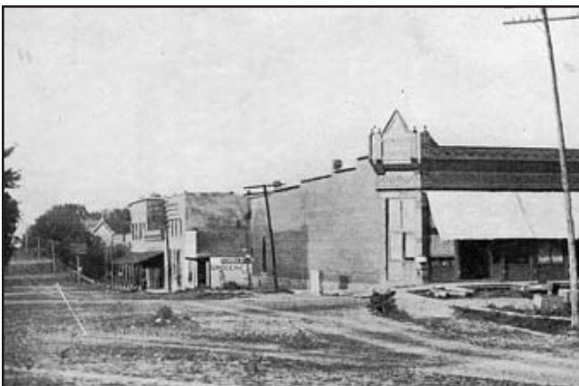
Our earliest view of Warren's corner and the dirt streets intersection in 1908.