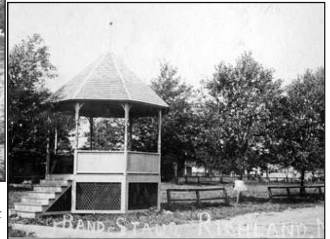
Richland had a town band by 1890.