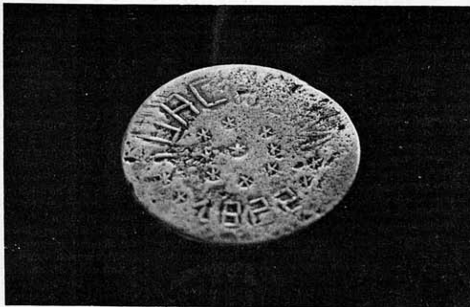
ONE OF THE FAMOUS YOAKUM SILVER DOLLARS!