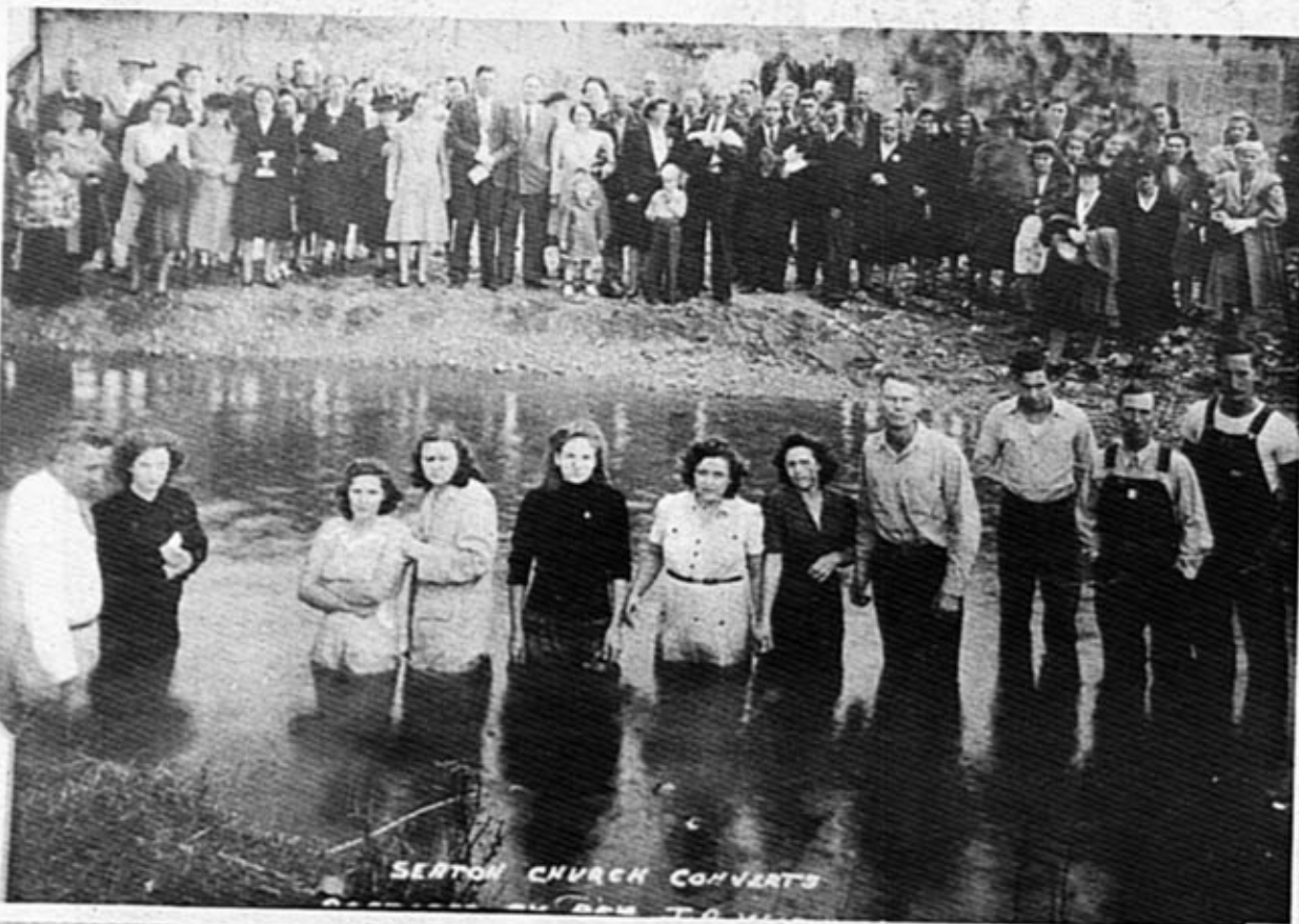
Left Photo - Converts wait to be baptized as the congregation of Seaton Church gather around to witness the event on November 2, 1947.