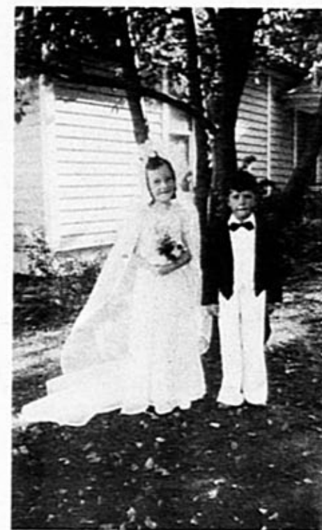
Young couple "tying the knot" back in 1942 were in reality participants in a Richland School play.