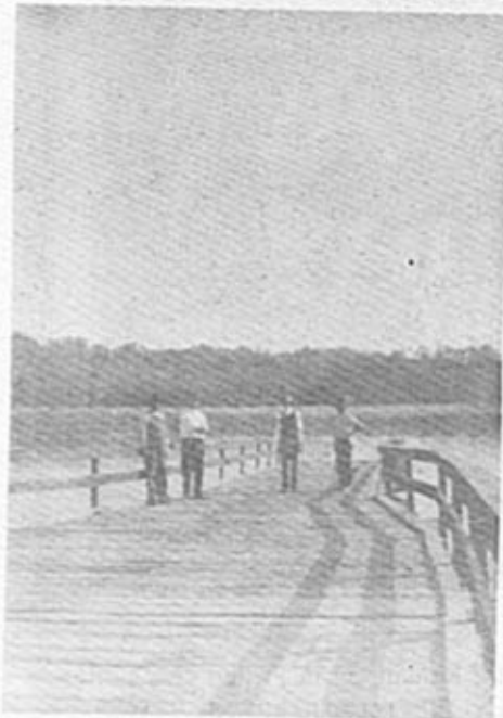
Old Hazelgreen Bridge at Flood Stage.