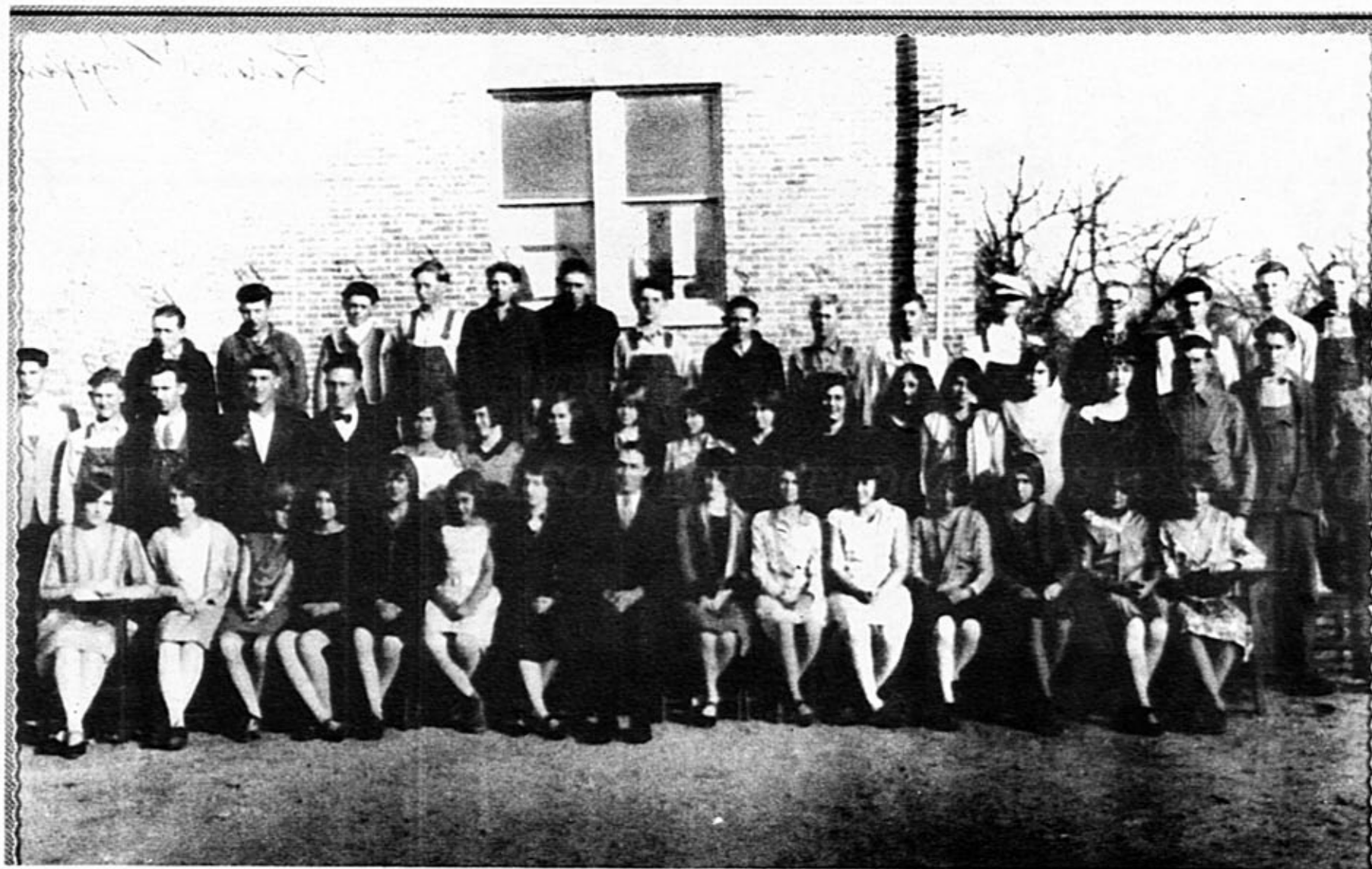
Bloodland, Missouri High School 1929 - 1930