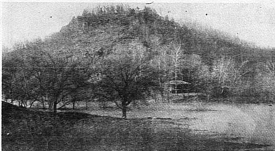
No. 5343 Piney River Emptying into the Gasconade at Arlington, Mo.