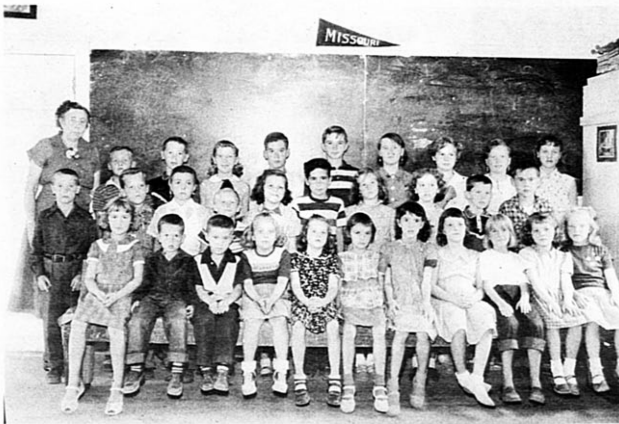
Big Piney School 1954 - 1956