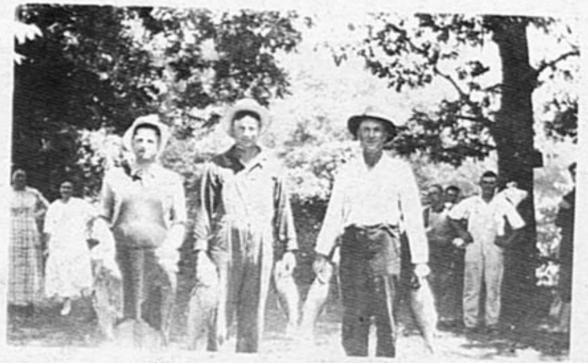
Fishing was good on the Gasconade sometime around the 1910 for three anglers.