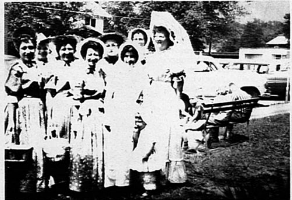
Waynesville Study Club ladies dressed in old time finery.