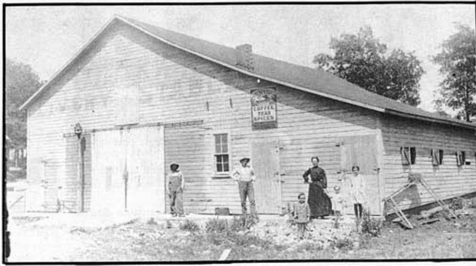
The Ozark Livery Stable in Dixon, Missouri.