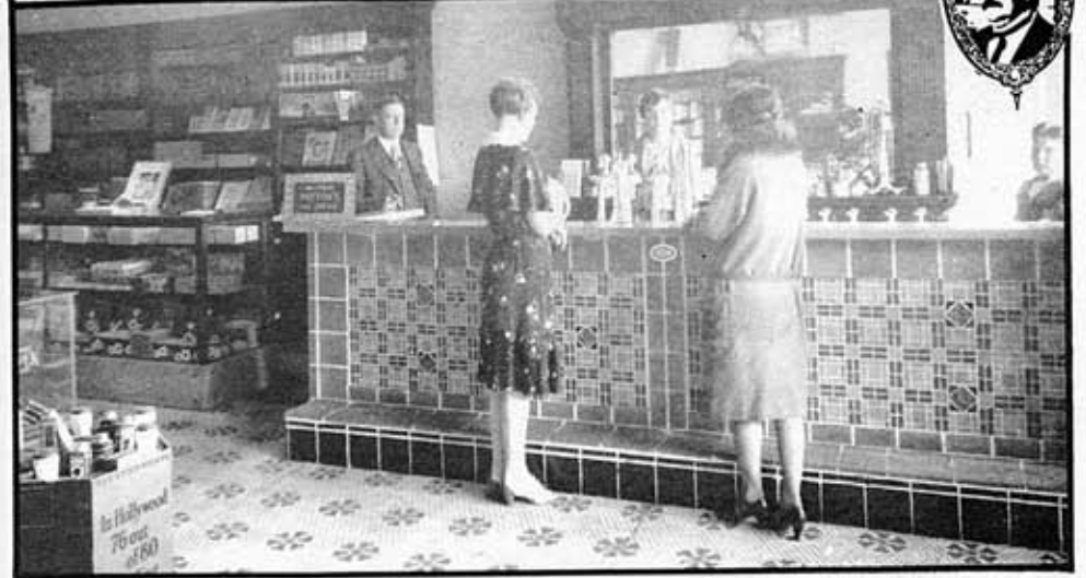
Dixon Drug featured the town's first all electric fountain.